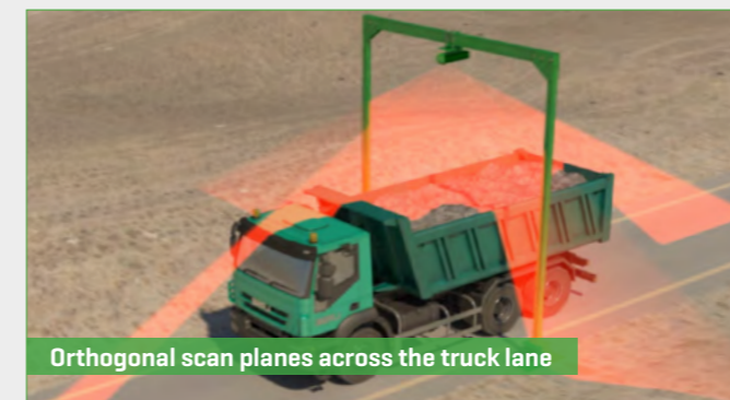
Orthogonal scan planes across the truck lane