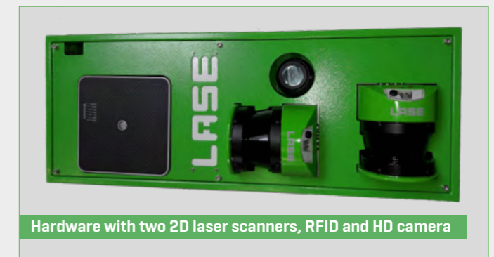
Hardware with two 2D laser scanners, RFID and HD camera