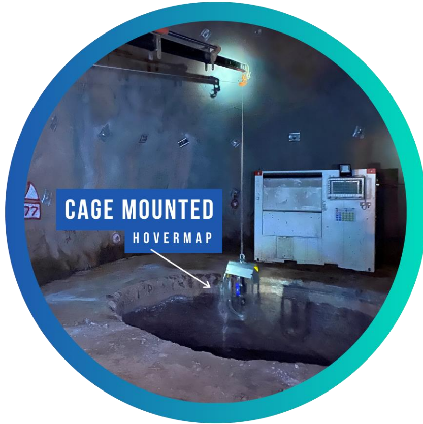
RAISE BORE SCAN