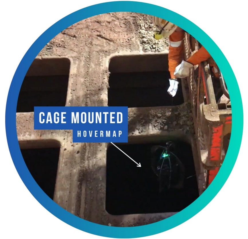
ORE PASS SCAN